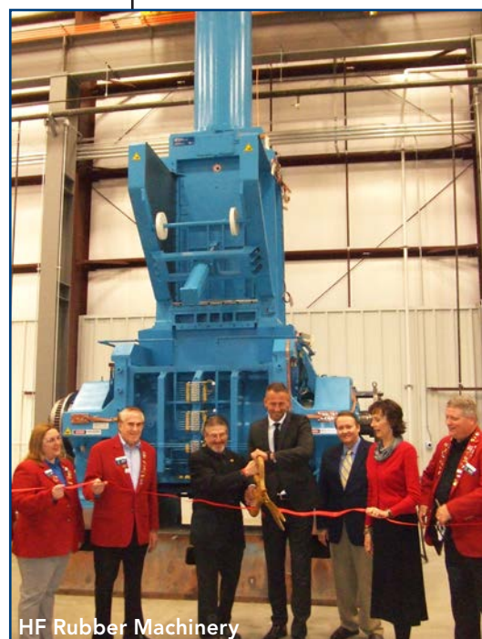
HF Rubber Machinery